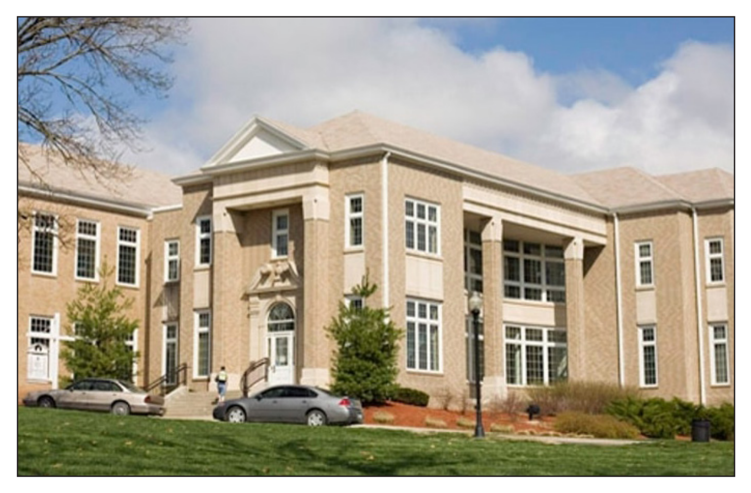
The Reeves Library is also home to the Student Success Center which offers services like Career Developmen and Academic Advising.

program. (See the Graduation Requirements section of this catalog for additional requirements.) If a course submitted for transfer credit does not match a course included in General Education, but meets the collegewide learning goals associated with the General Education context, the Associate Dean of Faculty may award a substitution. If a course submitted for transfer credit in the major or minor does not match the departmental requirements, the Department Chair will decide if the course may count toward the major or minor.